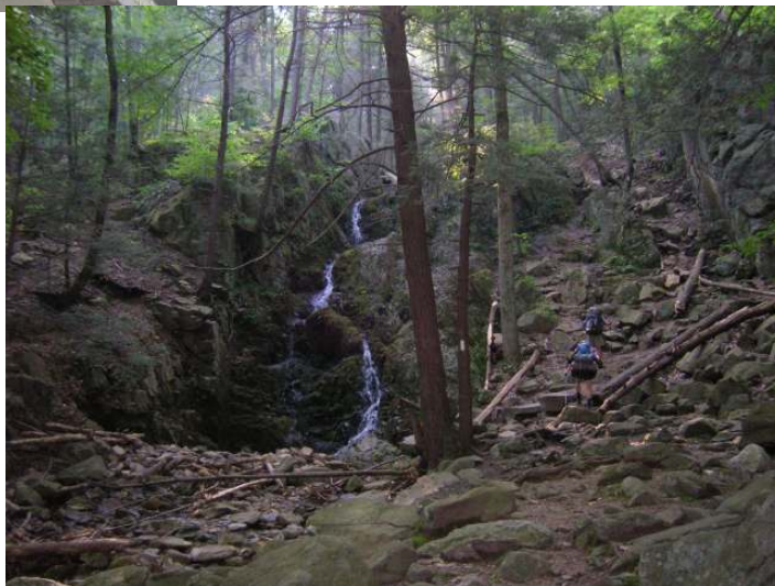
Scenes along the northern part of the Appalachian Trail