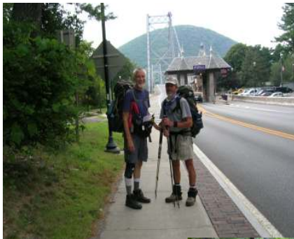
"Jericho" & "Skywalker" in front of Big Bear Bridge

Steve Root has traveled over 1600 miles of the 2174.6 miles of the Appalachian Trail. The following are excerpts from a typical day's trail diary from Massachusetts: